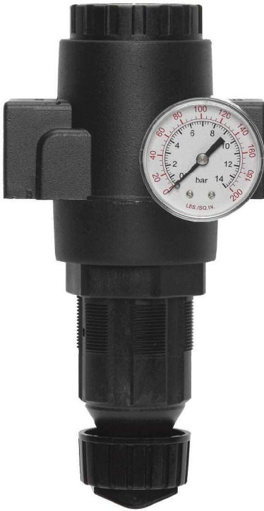
Model Shown: R180M-6G